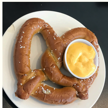
Left:: A Chicken Panini, Right: A pretzel with Cheese